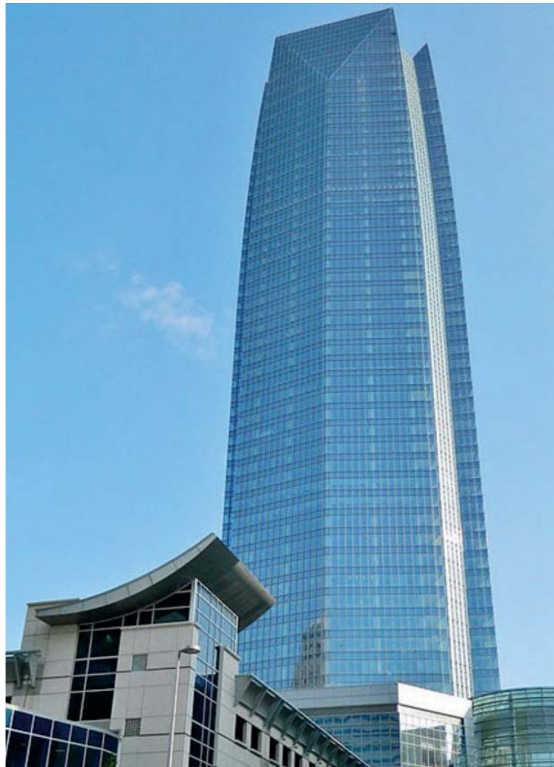
Thermafiber® mineral wool insulation was used in the perimeter fire containment system in the Devon Energy Center in Oklahoma City, OK.

Job Name _____ Contractor _____ Date _____