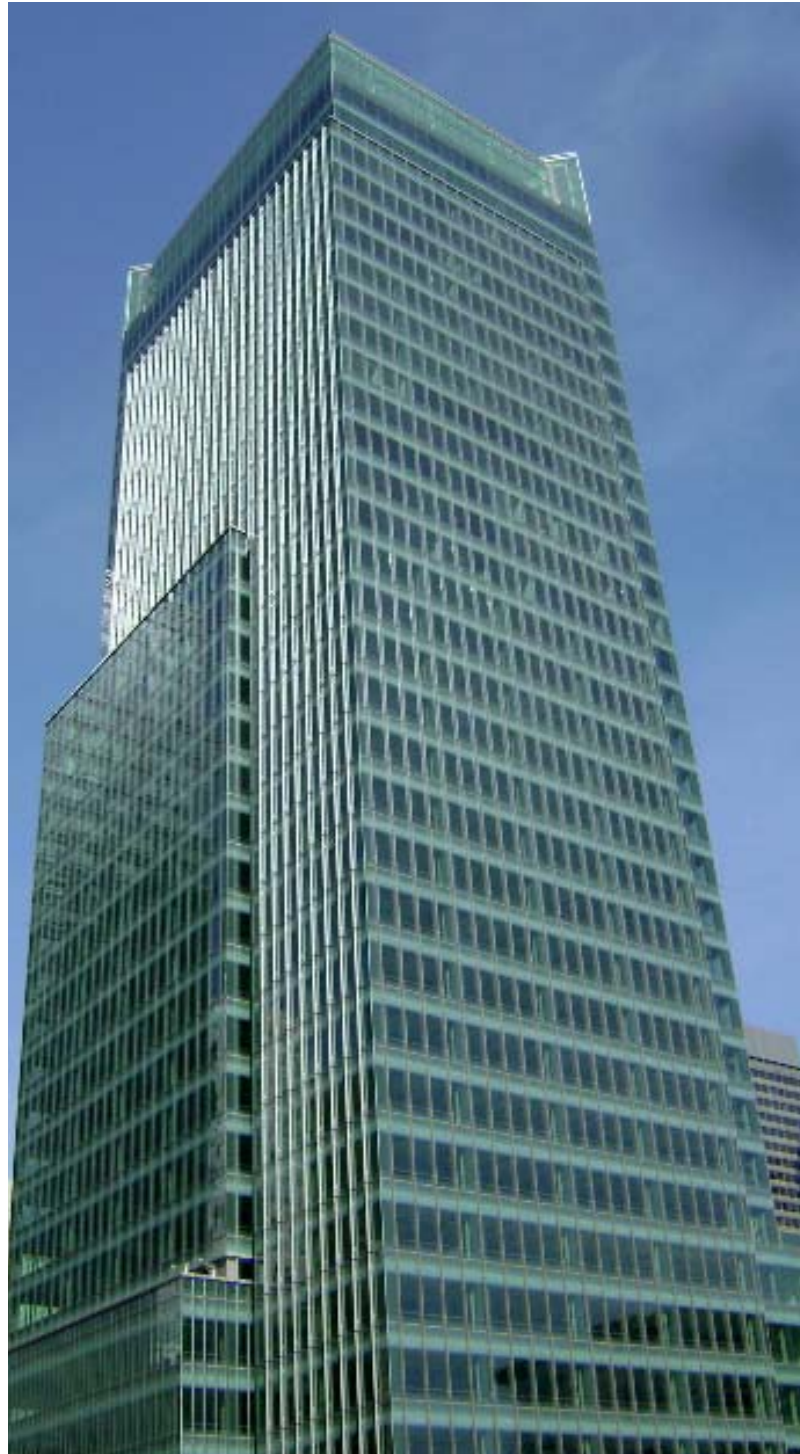
Thermafiber® Impasse® Hangers were used to secure the Firespan® mineral wool insulation for the perimeter fire containment system in the 555 Mission building in San Francisco, CA. Thermafiber® insulation also contributed to the LEED® silver rating for this building.

Job Name _____ Contractor _____ Date _____