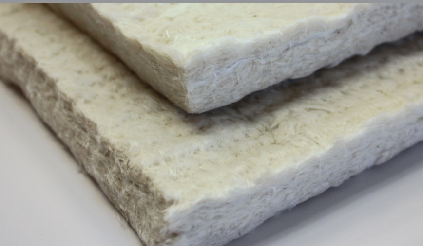
ThermaTex 1800 needled blanket is bio-soluble, mechanically bonded mineral fiber mat insulation designed for us in applications up to 1800°F / 982°C.